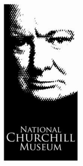
501 Westminster Avenue Fulton, Missouri 65251